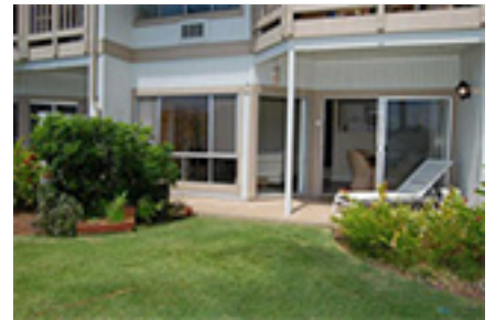
Mawaena Kai 1/2/3 Condo/Townhouse Beds Total:2, Baths Total:2.00 $610,000