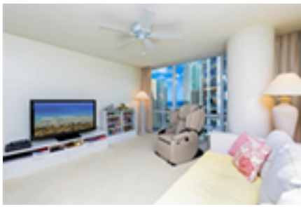
Hawaiki Tower Condo/Townhouse Beds Total:1, Baths Total:1.00 $690,000