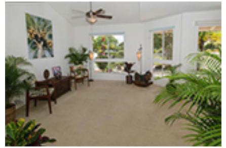
Greens At Waikale Condo/Townhouse Beds Total:3, Baths Total:2.01 $457,000