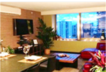
Capitol Place Condo/Townhouse Beds Total:2, Baths Total:2.00 $770,000