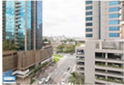
Century Square Condo/Townhouse Beds Total:2, Baths Total:1.00 $75,000