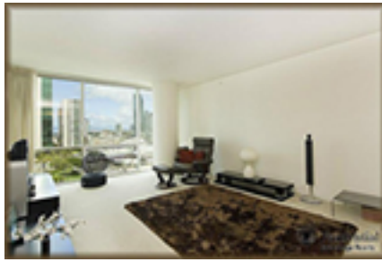
Hawaiki Tower Condo/Townhouse Beds Total:1, Baths Total:1.00 $575,000