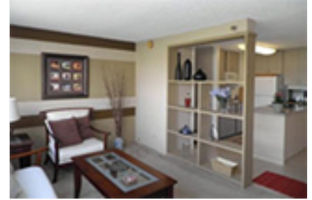
Island Colony Condo/Townhouse Beds Total:1, Baths Total:1.00 $235,000