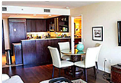
The Watermark Condo/Townhouse Beds Total:2, Baths Total:2.00 $1,180,000