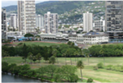
Fairway Villa Condo/Townhouse Beds Total:1, Baths Total:1.00 $310,000