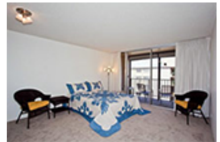
Fairway Villa Condo/Townhouse Beds Total:0, Baths Total:1.00 $232,000