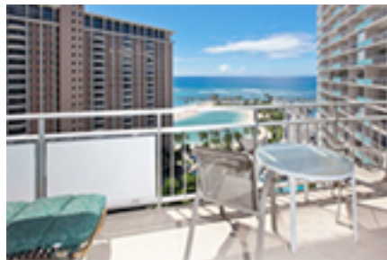
Ilikai Apt Bldg Condo/Townhouse Beds Total:1, Baths Total:1.00 $520,000