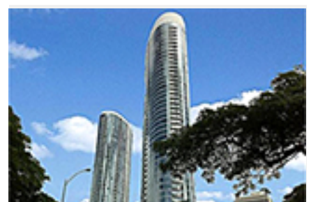
Moana Pacific Condo/Townhouse Beds Total:2, Baths Total:2.00 $585,000