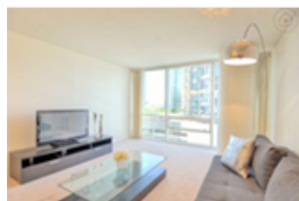
Hawaiki Tower Condo/Townhouse Beds Total:1, Baths Total:1.00 $688,000