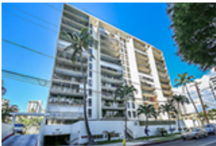
250 Ohua Condo/Townhouse Beds Total:2, Baths Total:2.00 $515,000