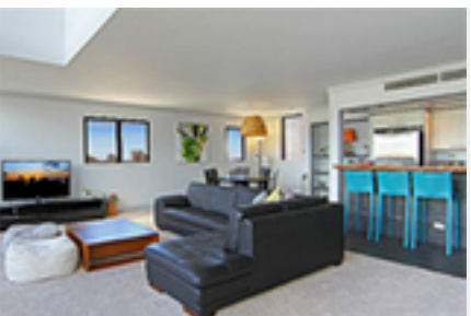
Royal Kuhio Condo/Townhouse Beds Total:3, Baths Total:3.00 $400,000