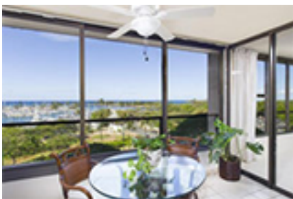
Yacht Harbor Towers Condo/Townhouse Beds Total:1, Baths Total:1.00 $550,000