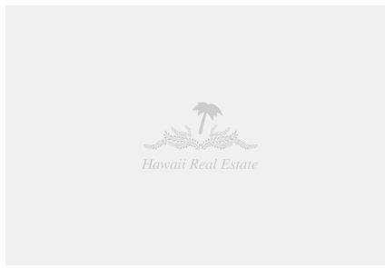
Hawaiki Tower Condo/Townhouse Beds Total:1, Baths Total:1.00 $748,000