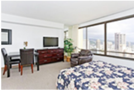
Discovery Bay Condo/Townhouse Beds Total:0, Baths Total:1.00 $188,000