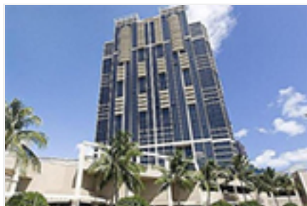
Keola Lai Condo/Townhouse Beds Total:1, Baths Total:1.00 $510,000