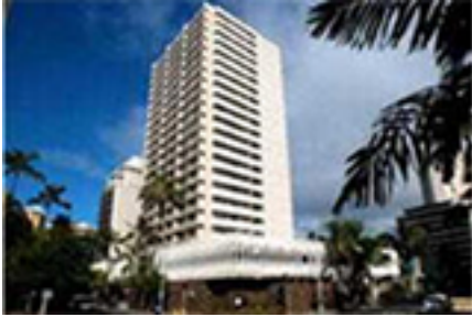
Marine Surf Waikiki Condo/Townhouse Beds Total:0, Baths Total:1.00 $229,000