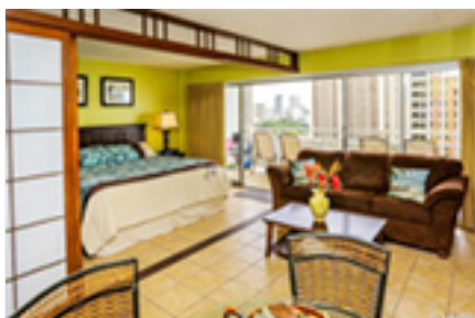
Ilikai Apt Bldg Condo/Townhouse Beds Total:1, Baths Total:1.00 $532,000