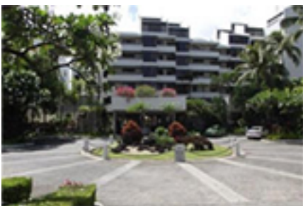
Esplanade Condo/Townhouse Beds Total:2, Baths Total:2.00 $450,000