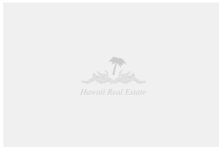
Moana Pacific Condo/Townhouse Beds Total:2, Baths Total:2.01 $685,000