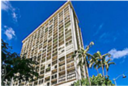
Fairway Villa Condo/Townhouse Beds Total:0, Baths Total:1.00 $255,000