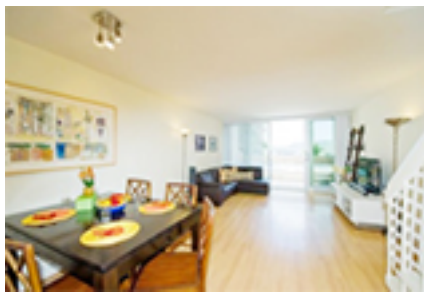
Ala Wai Plaza Condo/Townhouse Beds Total:2, Baths Total:2.01 $520,000