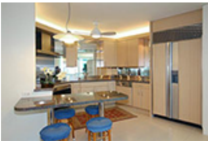
Hawaiki Tower Condo/Townhouse Beds Total:1, Baths Total:1.00 $600,000