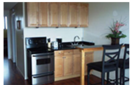
Aloha Lani Condo/Townhouse Beds Total:1, Baths Total:1.00 $258,000