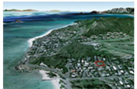
577 Kawailoa Rd $900,000