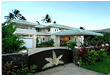
Portlock Rd, Honolulu 96825 Single Family Beds Total:5, Baths Total:5.01 $2,875,000