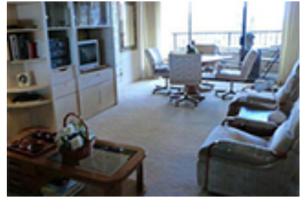
Discovery Bay Condo/Townhouse Beds Total:1, Baths Total:1.00 $225,000