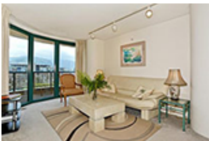
The Watermark Condo/Townhouse Beds Total:2, Baths Total:2.00 $890,000