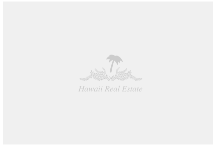
Moana Pacific Condo/Townhouse Beds Total:2, Baths Total:2.00 $530,000