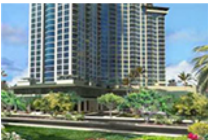
Allure Waikiki Condo/Townhouse Beds Total:2, Baths Total:2.00 $974,500