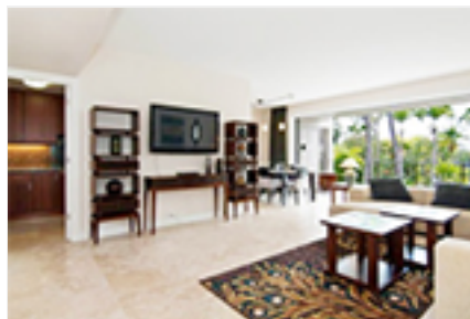
Kahala Beach Condo/Townhouse Beds Total:2, Baths Total:2.00 $180,000