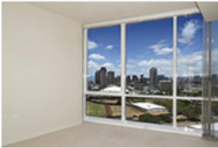
Moana Pacific Condo/Townhouse Beds Total:2, Baths Total:2.00 $530,000