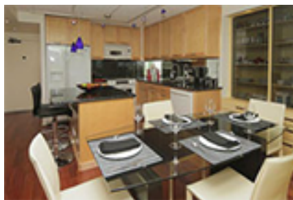
Aloha Towers Condo/Townhouse Beds Total:2, Baths Total:2.00 $580,000