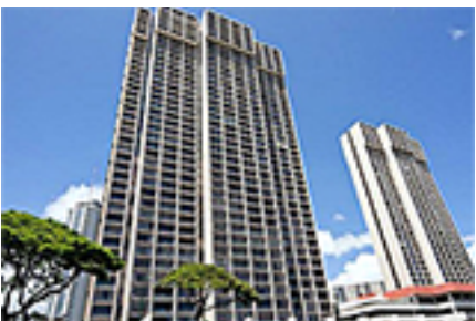
Yacht Harbor Towers Condo/Townhouse Beds Total:3, Baths Total:3.00 $1,250,000