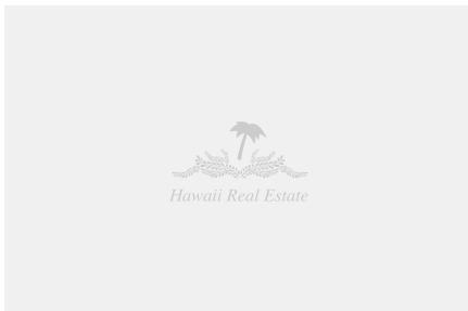
Moana Pacific Condo/Townhouse Beds Total:2, Baths Total:2.00 $640,000