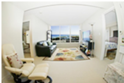
Pacifica Honolulu Condo/Townhouse Beds Total:2, Baths Total:2.00 $695,000