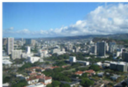
Moana Pacific Condo/Townhouse Beds Total:1, Baths Total:1.00 $455,000