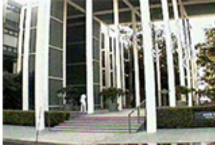
Kahala Beach Condo/Townhouse Beds Total:2, Baths Total:2.00 $137,000