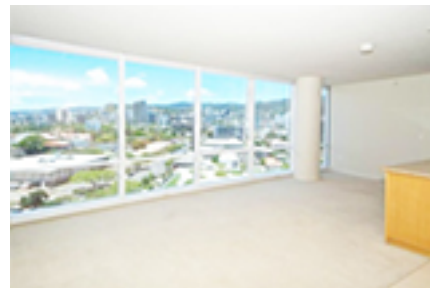
Moana Pacific Condo/Townhouse Beds Total:1, Baths Total:1.00 $515,000