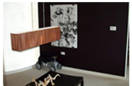
Moana Pacific Condo/Townhouse Beds Total:2, Baths Total:2.00 $520,000