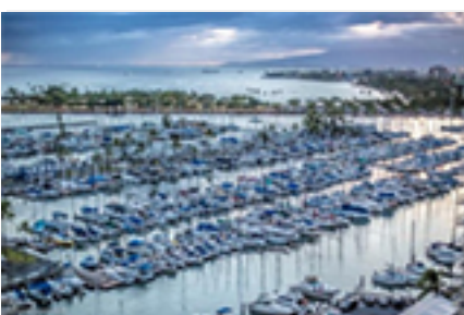
Ilikai Apt Bldg Condo/Townhouse Beds Total:1, Baths Total:1.00 $588,000