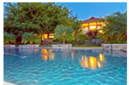
Hoalike Rd, Haleiwa 96712 Single Family Beds Total:4, Baths Total:7.00 $2,080,000