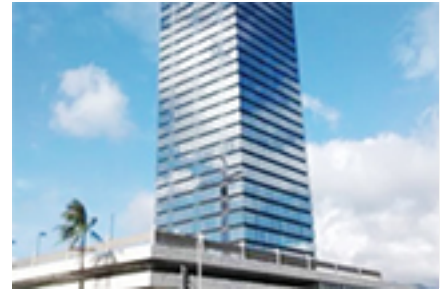
Century Center Condo/Townhouse Beds Total:0, Baths Total:1.00 $115,000