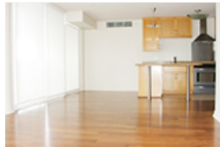
Moana Pacific Condo/Townhouse Beds Total:3, Baths Total:2.00 $780,000