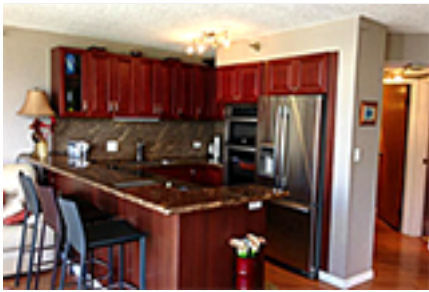
Liliuokalani Gardens Condo/Townhouse Beds Total:2, Baths Total:2.00 $560,000