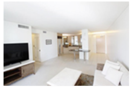
Hawaiki Tower Condo/Townhouse Beds Total:2, Baths Total:2.00 $850,000