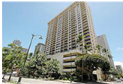
Four Paddle Condo/Townhouse Beds Total:1, Baths Total:1.00 $345,000