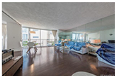
2987 Kalakaua Condo/Townhouse Beds Total:1, Baths Total:1.00 $793,000