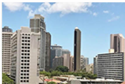
Kapiolani Manor Condo/Townhouse Beds Total:1, Baths Total:1.00 $347,000