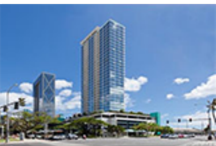
909 Kapiolani Condo/Townhouse Beds Total:2, Baths Total:2.00 $700,000