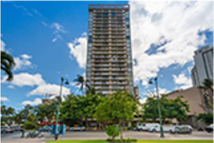
Pavilion At Waikiki Condo/Townhouse Beds Total:1, Baths Total:1.00 $360,000