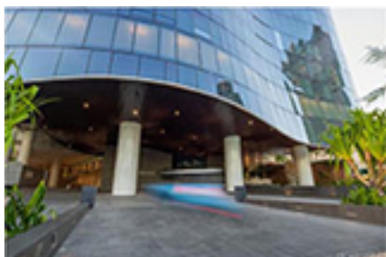
Waiea - 1118 Ala Moana Condo/Townhouse Beds Total:3, Baths Total:3.00 $4,900,000