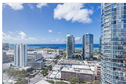
Moana Pacific Condo/Townhouse Beds Total:3, Baths Total:2.00 $950,000