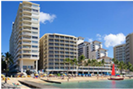
Waikiki Shore Condo/Townhouse Beds Total:1, Baths Total:1.00 $1,320,000