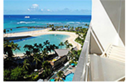
Ilikai Condo/Townhouse Beds Total:1, Baths Total:1.00 $555,000