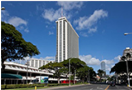
Ala Moana Hotel Condo Condo/Townhouse Beds Total:0, Baths Total:1.00 $175,000