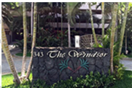
Windsor The Condo/Townhouse Beds Total:1, Baths Total:1.00 $482,500