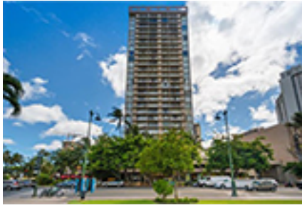
Pavilion At Waikiki Condo/Townhouse Beds Total:1, Baths Total:1.00 $365,000