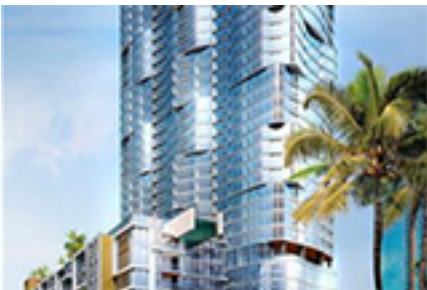
Anaha - 1108 Auahi Condo/Townhouse Beds Total:2, Baths Total:2.00 $1,800,000