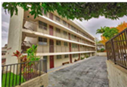
Lusitana Gardens Condo/Townhouse Beds Total:1, Baths Total:1.00 $265,000