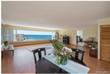
Ilikai Apt Bldg Condo/Townhouse Beds Total:1, Baths Total:2.00 $1,650,000