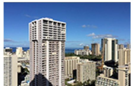
Island Colony Condo/Townhouse Beds Total:0, Baths Total:1.00 $260,000