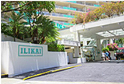
Ilikai Condo/Townhouse Beds Total:1, Baths Total:1.00 $520,000