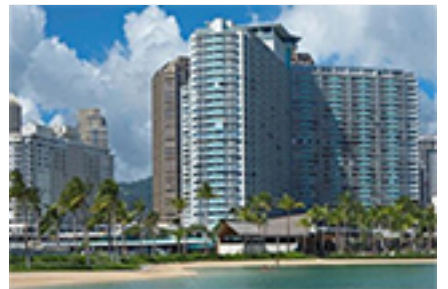
Ilikai Apt Bldg Condo/Townhouse Beds Total:1, Baths Total:1.00 $576,000