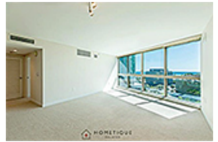
Koolani Condo/Townhouse Beds Total:2, Baths Total:2.00 $820,000