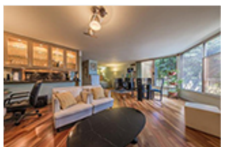
Diamond Head Vista Condo/Townhouse Beds Total:1, Baths Total:1.00 $440,000