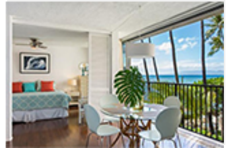
2987 Kalakaua Condo/Townhouse Beds Total:1, Baths Total:1.00 $742,000