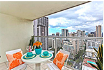
Island Colony Condo/Townhouse Beds Total:1, Baths Total:1.00 $340,000