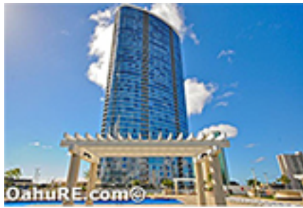
Moana Pacific Condo/Townhouse Beds Total:2, Baths Total:2.00 $680,000