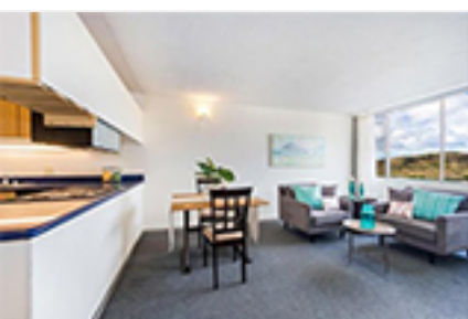
Harbour Ridge Condo/Townhouse Beds Total:1, Baths Total:1.00 $300,000