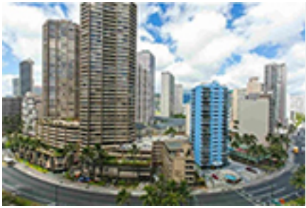
Ilikai Apt Bldg Condo/Townhouse Beds Total:2, Baths Total:2.00 $950,000