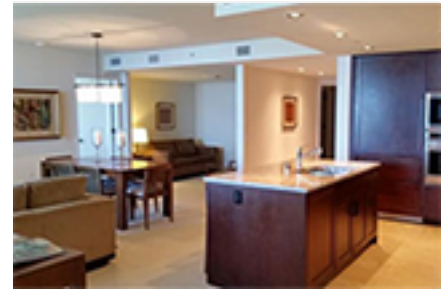
Trump Tower Waikiki Condo/Townhouse Beds Total:2, Baths Total:3.00 $2,498,800