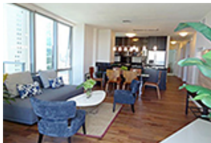
Waihonua Condo/Townhouse Beds Total:3, Baths Total:2.00 $1,320,000