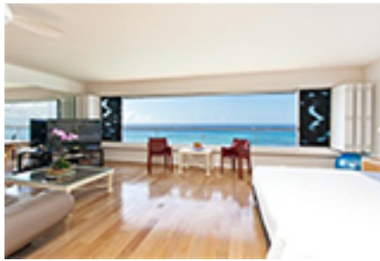
Colony Surf Ltd Condo/Townhouse Beds Total:1, Baths Total:1.00 $1,580,000