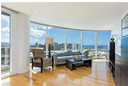
Moana Pacific Condo/Townhouse Beds Total:3, Baths Total:2.00 $825,000