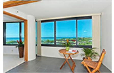
Nauru Tower Condo/Townhouse Beds Total:1, Baths Total:1.00 $750,000