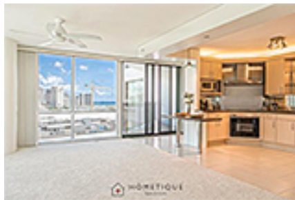
Hawaiki Tower Condo/Townhouse Beds Total:2, Baths Total:2.00 $880,000