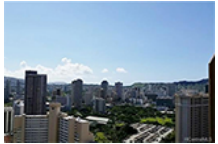
Discovery Bay Condo/Townhouse Beds Total:1, Baths Total:1.00 $260,000