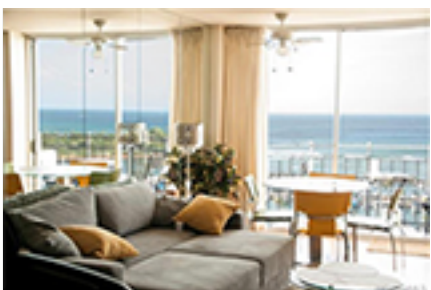
Ilikai Marina Condo/Townhouse Beds Total:1, Baths Total:1.00 $595,000