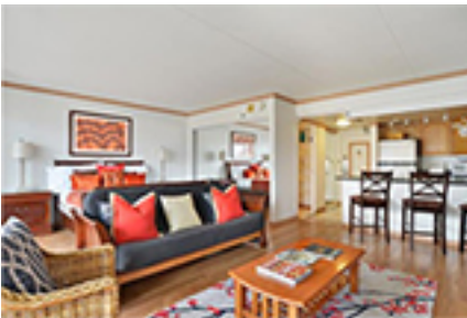
Ilikai Apt Bldg Condo/Townhouse Beds Total:1, Baths Total:1.00 $452,500