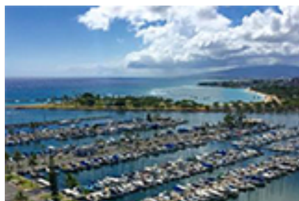
Ilikai Apt Bldg Condo/Townhouse Beds Total:1, Baths Total:1.00 $780,000