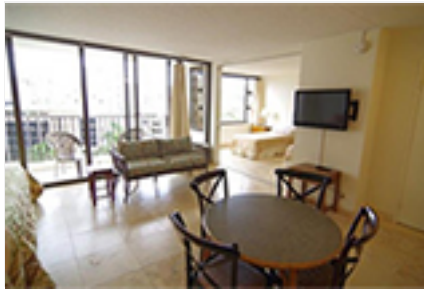
Waikiki banyan Condo/Townhouse Beds Total:1, Baths Total:1.00 $492,000