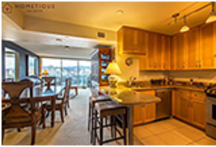
Moana Pacific Condo/Townhouse Beds Total:2, Baths Total:2.00 $632,000