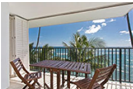
2987 Kalakaua Condo/Townhouse Beds Total:1, Baths Total:1.00 $975,000