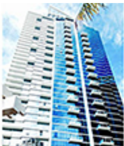
Waihonua Condo/Townhouse Beds Total:2, Baths Total:2.00 $860,000