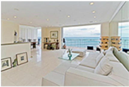
Diamond Head Apts Ltd Condo/Townhouse Beds Total:2, Baths Total:2.00 $1,850,000