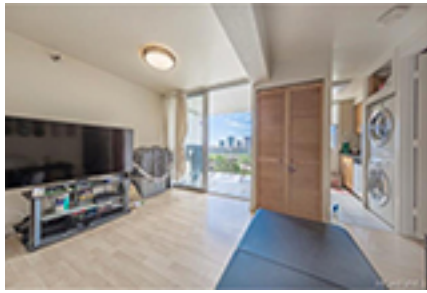
Fairway House Condo/Townhouse Beds Total:2, Baths Total:2.00 $499,000