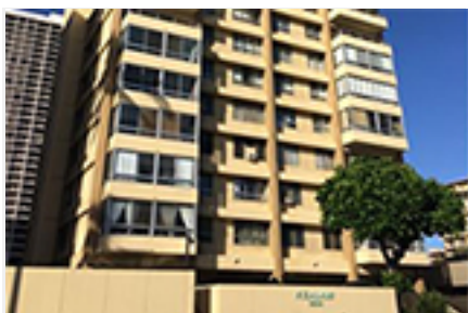
Kealani Condo/Townhouse Beds Total:2, Baths Total:2.00 $560,000