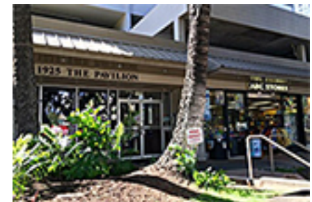
Pavilion at Waikiki Condo/Townhouse Beds Total:1, Baths Total:1.10 $350,000