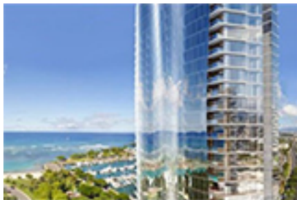
Waiea Condo/Townhouse Beds Total:3, Baths Total:3.10 $6,345,000