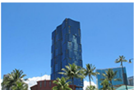
Anaha Condo/Townhouse Beds Total:1, Baths Total:1.00 $800,000