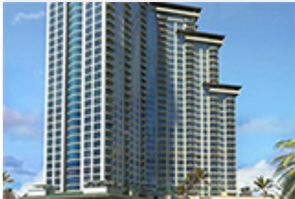
Allure Waikiki Condo/Townhouse Beds Total:2, Baths Total:2.00 $950,000