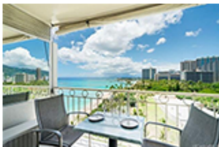
Waikiki Shore Condo/Townhouse Beds Total:0, Baths Total:1.00 $875,000