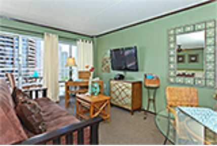
Ilikai Condo/Townhouse Beds Total:1, Baths Total:1.00 $422,000