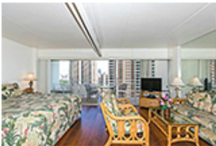
Ilikai Condo/Townhouse Beds Total:1, Baths Total:1.00 $557,500