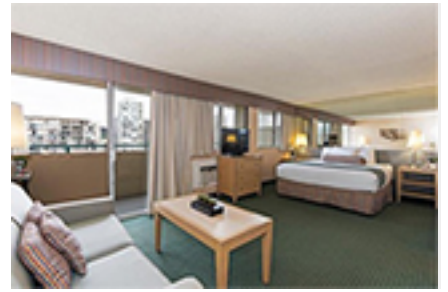
Aloha Surf Hotel Condo/Townhouse Beds Total:0, Baths Total:1.00 $230,000