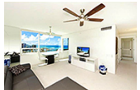
Hawaiki Tower Condo/Townhouse Beds Total:2, Baths Total:2.00 $1,287,500