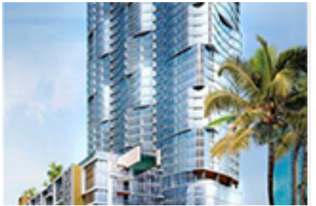
Anaha - 1108 Auahi Condo/Townhouse Beds Total:2, Baths Total:2.00 $1,455,000