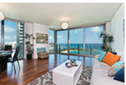
Hokua at 1288 ALa Moana Condo/Townhouse Beds Total:2, Baths Total:2.00 $2,650,000