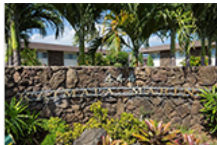
Kaimala Marina Condo/Townhouse Beds Total:3, Baths Total:2.01 $595,000