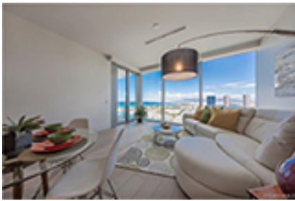
Waiea - 1118 Ala Moana Condo/Townhouse Beds Total:1, Baths Total:2.00 $1,900,000