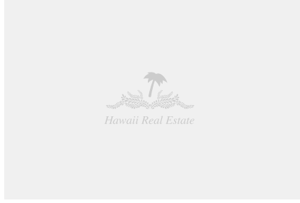
Koolani Condo/Townhouse Beds Total:2, Baths Total:2.00 $1,475,000