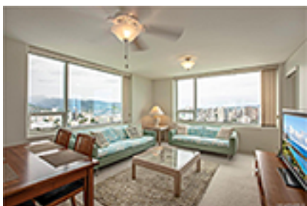
Hawaiki Tower Condo/Townhouse Beds Total:2, Baths Total:2.00 $1,180,000