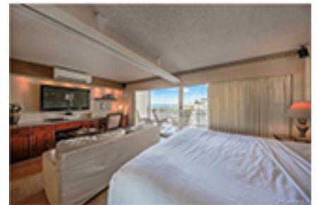
Ilikai Apt Bldg Condo/Townhouse Beds Total:1, Baths Total:1.00 $775,000