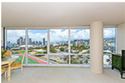
Moana Pacific Condo/Townhouse Beds Total:1, Baths Total:1.00 $625,000