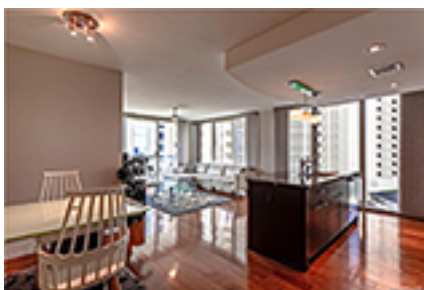
Allure Waikiki Condo/Townhouse Beds Total:2, Baths Total:2.00 $850,000