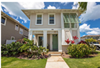
91-1241 Kaikohola Street #D92 Single Family Beds Total:4, Baths Total:2.01 $798,000