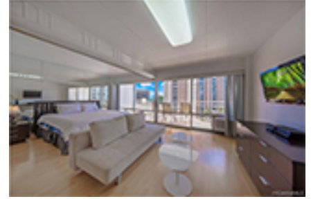
Ilikai Apt Bldg Condo/Townhouse Beds Total:1, Baths Total:1.00 $690,000