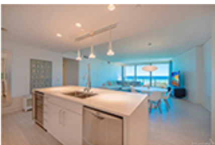
Hokua At 1288 Ala Moana Condo/Townhouse Beds Total:2, Baths Total:2.00 $2,150,000