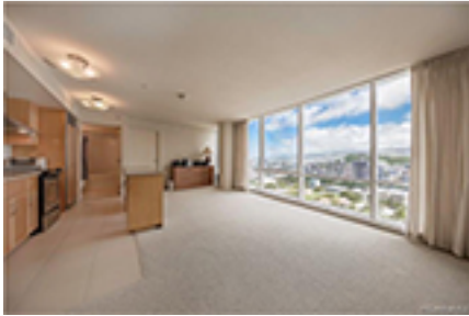
Moana Pacific Condo/Townhouse Beds Total:1, Baths Total:1.00 $635,000