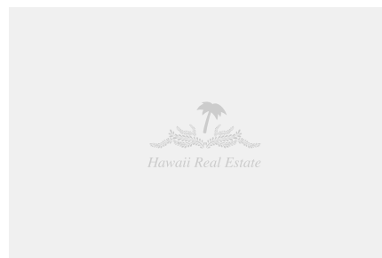
Allure Waikiki Condo/Townhouse Beds Total:2, Baths Total:2.00 $970,000