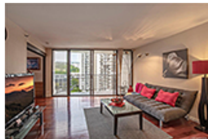
Park At Pearlridge Condo/Townhouse Beds Total:3, Baths Total:2.00 $475,000