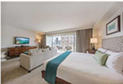
Ilikai Apt Bldg Condo/Townhouse Beds Total:1, Baths Total:1.00 $730,000