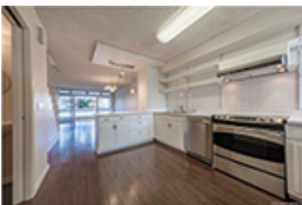
Ala Wai Plaza Condo/Townhouse Beds Total:3, Baths Total:2.01 $590,000