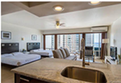
Ilikai Apt Bldg Condo/Townhouse Beds Total:1, Baths Total:1.00 $770,000