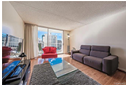
Villa on Eaton Square Condo/Townhouse Beds Total:1, Baths Total:1.00 $225,000