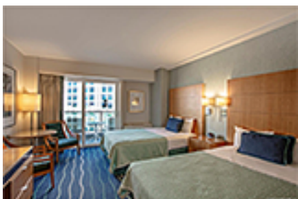
Ala Moana Hotel Condo Condo/Townhouse Beds Total:0, Baths Total:1.00 $155,000