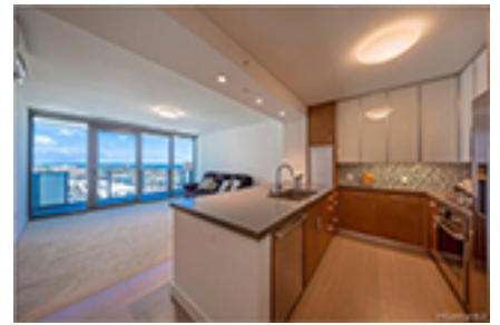
The Collection Condo/Townhouse Beds Total:1, Baths Total:1.00 $709,000