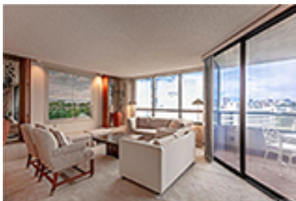
Punahou Cliffs Condo/Townhouse Beds Total:2, Baths Total:2.00 $735,000