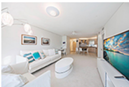
Hawaiki Tower Condo/Townhouse Beds Total:1, Baths Total:1.00 $750,000