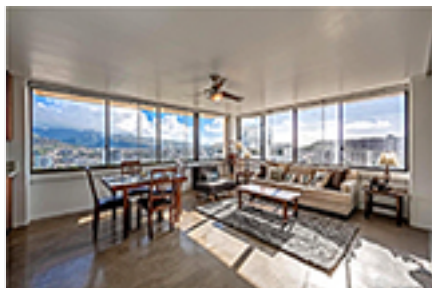
Waikiki Skytower Condo/Townhouse Beds Total:1, Baths Total:1.00 $462,000