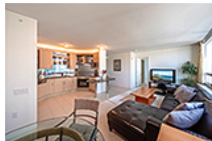
Hawaiki Tower Condo/Townhouse Beds Total:2, Baths Total:2.00 $810,000